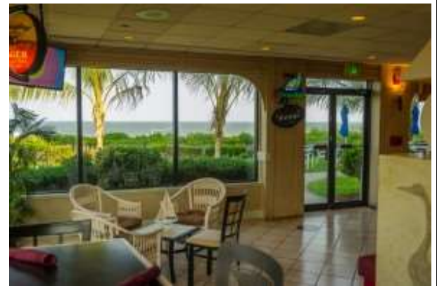
Schooners on-site Lounge and Restaurant