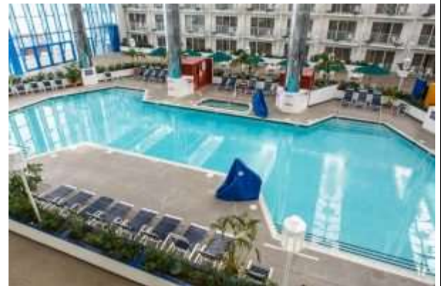
Pool level Atrium Suites will serve as Hospitality Rooms at a cost of $99.00 plus tax ($110.90). Add'l $30 charge to remove beds.